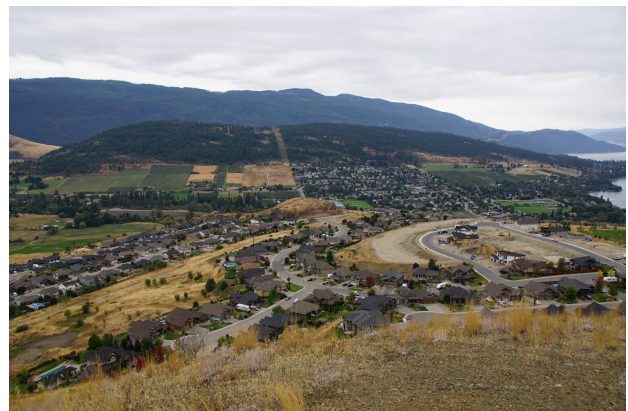
View of Vernon from Middleton Mtn.

Brian Springinotec of Habitat Conservation Trust Foundation (HCTF) gave a comprehensive talk about the Foundations grants program for environmental projects in BC. For the past 7 years they have made approximately 150 grants a year for projects that restore, maintain, or enhance native freshwater fish and wildlife populations and habitats. Also initiatives on environmental education and stewardship projects are supported. As well, projects to acquire land to secure the value of these areas for conservation purposes are considered. In the last 4 years HCTF has made grants of approximately $750,000 per year. HCTF's website http://www.hctf.ca gives a comprehensive outline of the past and current projects as well as the deadlines and guidelines for submitting each type of grant. This organization presents an excellent opportunity for BC Nature and its clubs to receive grants for even large projects. Check out the website!