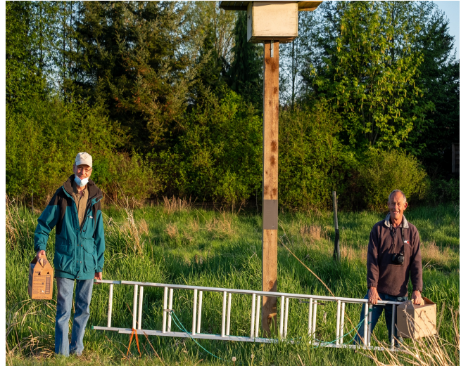
Ready to rehome the owls

They were fortunate in that somebody found them and delivered them to OWL for rehabilitation. OWL does not relocate owls during the winter months and now, as adults, they were ready to be introduced back into their natural environment.