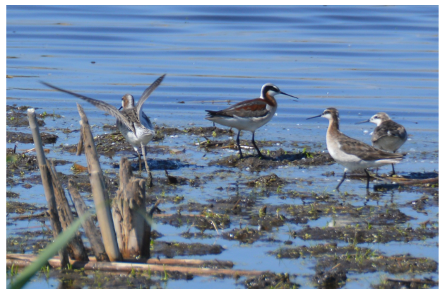
Wilson's Phalarope at Gordon's Brook