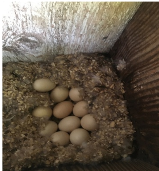
Wood Duck eggs