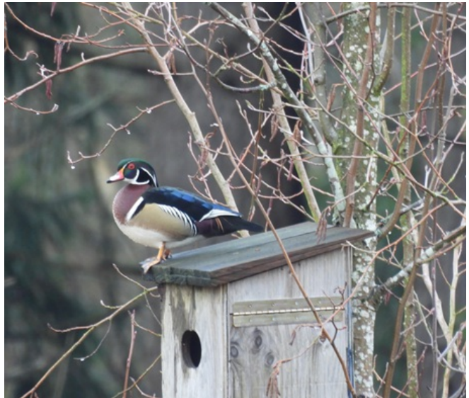
Male Wood Duck on nesting box

in 2020 there were six wood duck nesting boxes in place, with two boxes having a clutch of eggs. This year there are seven nesting boxes, and a clutch of eleven eggs in only one of the boxes. The box with the eggs was installed last year.