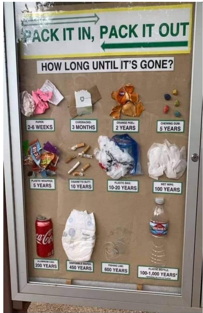
Not necessarily completely accurate (often "it depends") but it gives a good visual reminder!